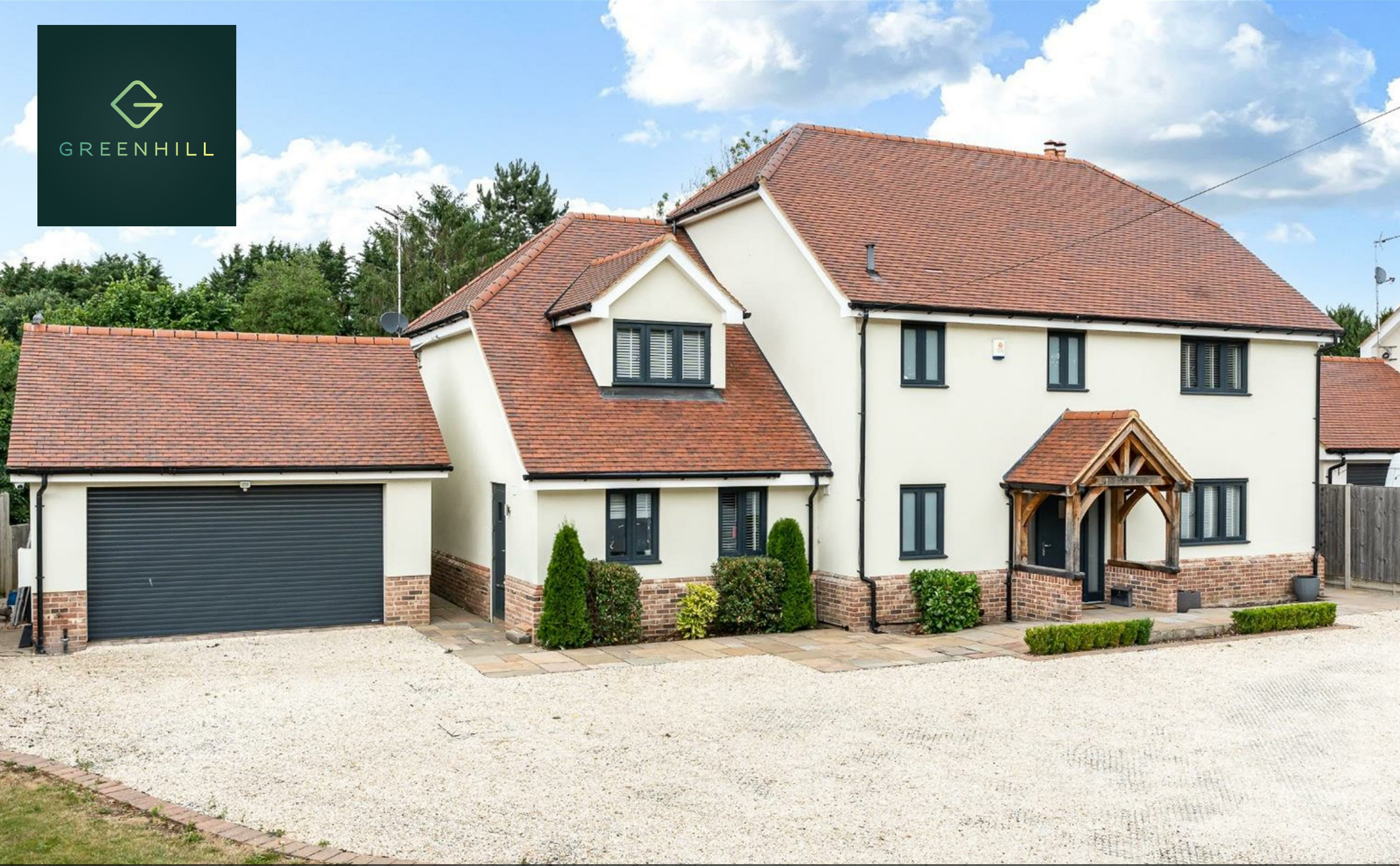
Ashtree House Hoe Lane Nazeing, Waltham Abbey, EN9 2RJ Guide price £1,399,950